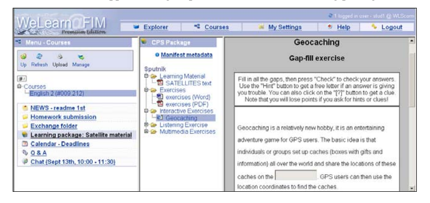
Figure 1 An opened learning package in the WeLearn platform

After the course manager had been given the 'empty' course folder the actual setting up of the arrangement begins. The learning material itself was structured using the jCAPT editor (see 5.5), then the resulting CPS package was uploaded into WeLearn and applied. Image 1 presents a view of the learning package.